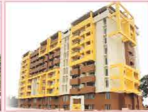
WILLOWS Neermarga, Mangalore