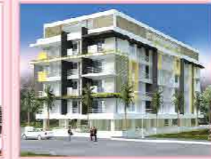
SAFAL HOMES Kuloor-Kavoor Road, Mangalore