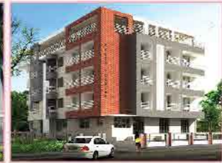
GREEN FORTUNE End Point, Manipal