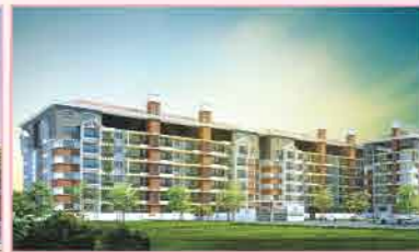
VRINDAVAN Gandhi Nagar, Mannagudda, Mangalore