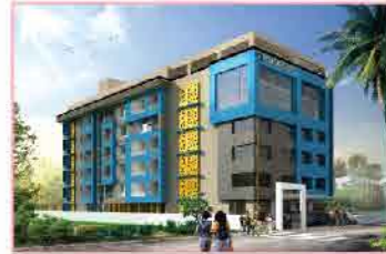
NEWBERRY ENCLAVE Bejai-Kapikad, Mangalore