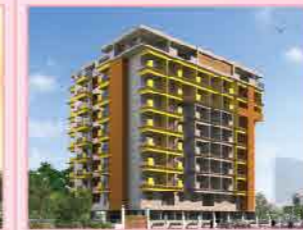
ROSARY COTTAGE Kulshekar, Mangalore