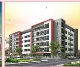
JARDIN Opp to Market, Surathkal