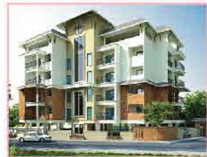
SAATHVIK HOMES Matadakani Main Road, Mangalore